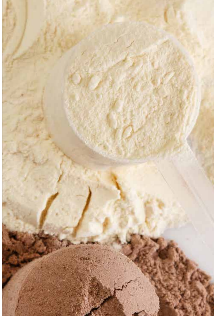
SUPPLEMENT & FUNCTIONAL FLAVORS