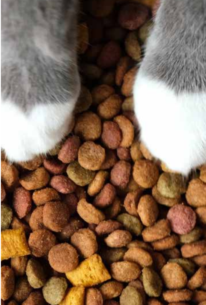
PET FOOD FLAVORS