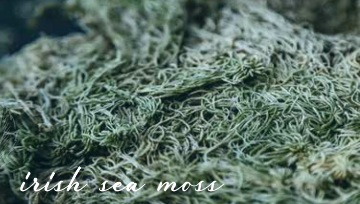
irish sea moss